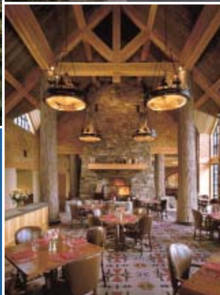
The Clubhouse (top) and the clubhouse interior reflect design from the turn of the century. (Above) The Member Cabins offer lodging for members and their guests.