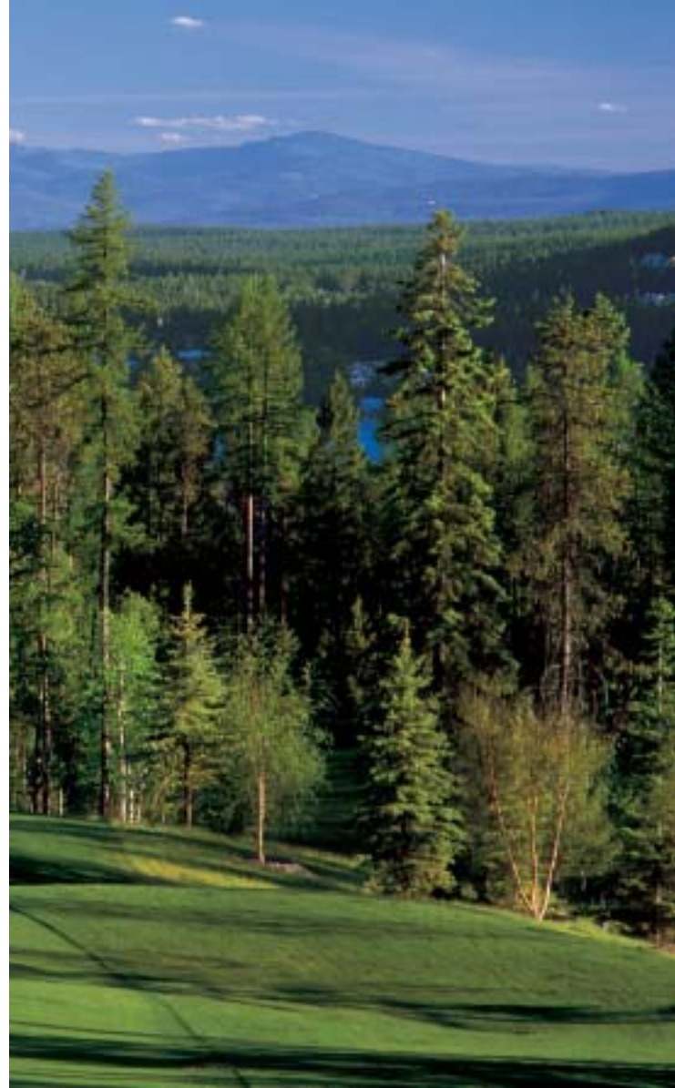
IRON HORSE

member cabins. Iron Horse is a Tom Fazio-designed, 375 member private equity club.